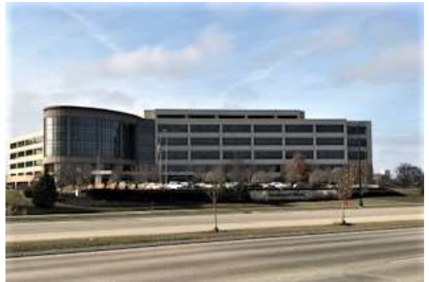
Kilbourn School site, now part of the Northwestern Mutual Franklin Campus